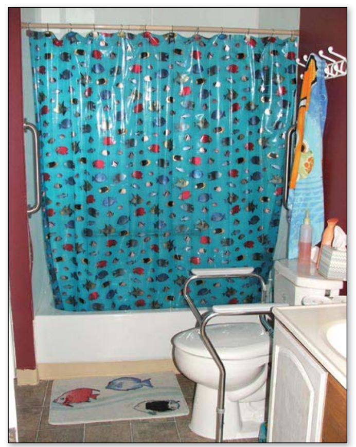
Bathrooms in the Senecal home were retrofitted with grab bars and ADA raised height toilets

SimplexGrinnell donated smoke alarms. GHEMM employees also finished installing a previously purchased exterior door.